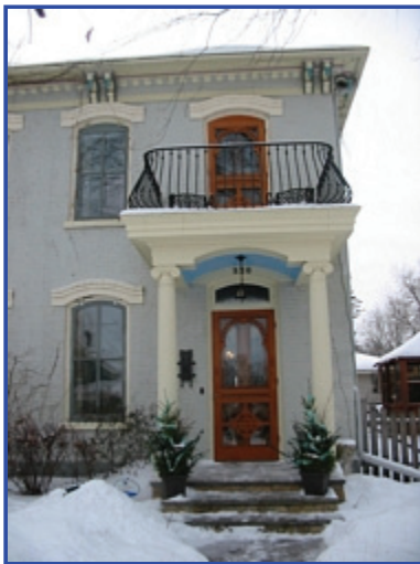
1st and 2nd floor exterior doors