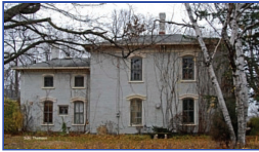
Click on photo to enlarge