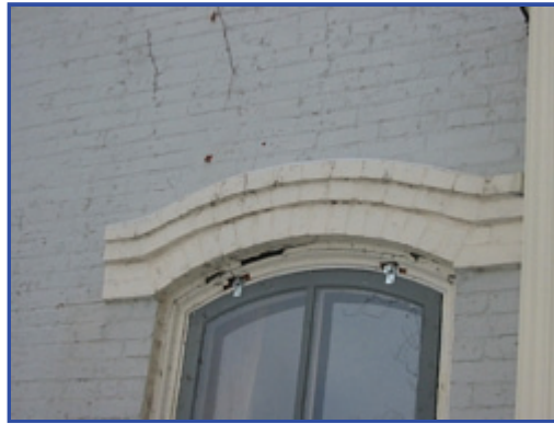
Brick hoods over windows